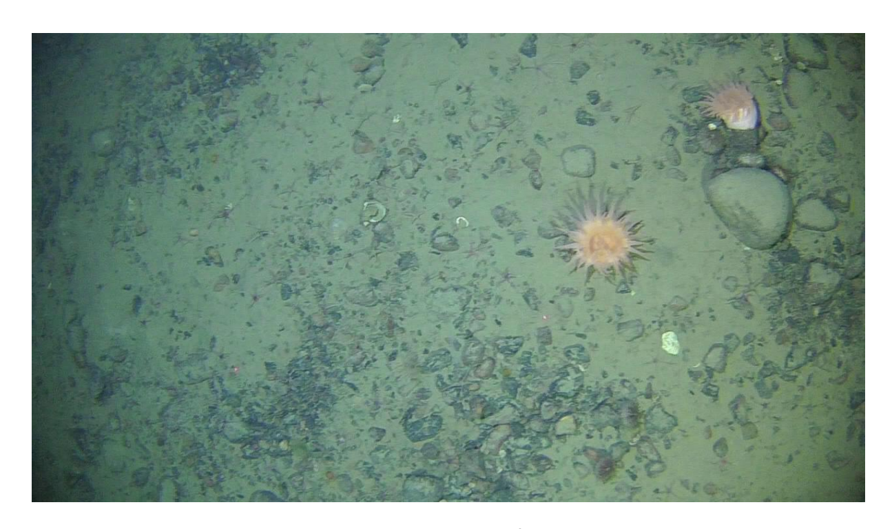
Fig. 2 Sea bottom in Rijpfjorden.