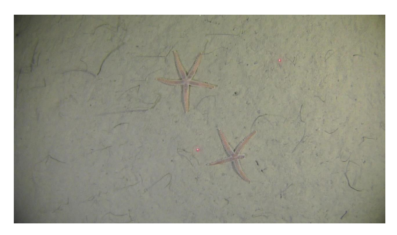
Fig. 4 Sea bottom in Kongsfjorden