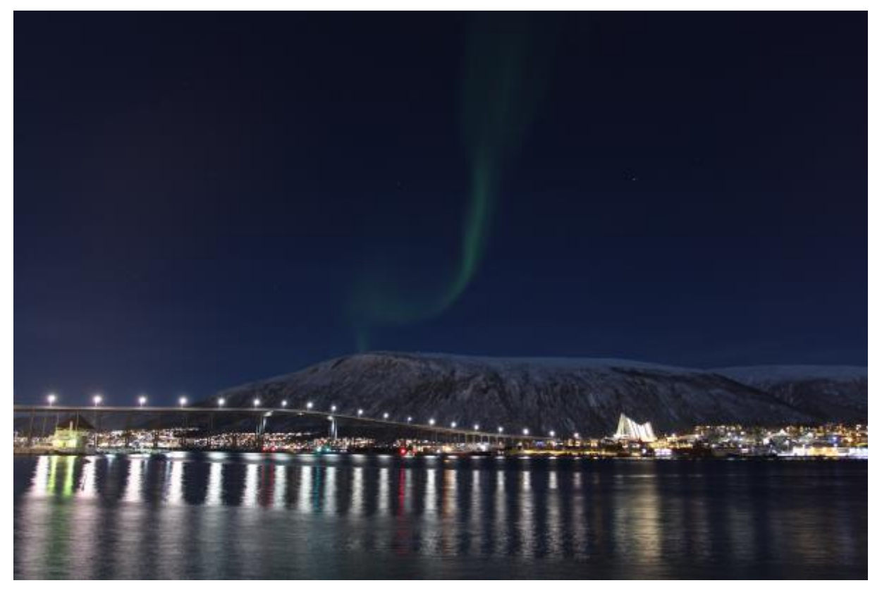
Figure 2. Northern lights in Tromso