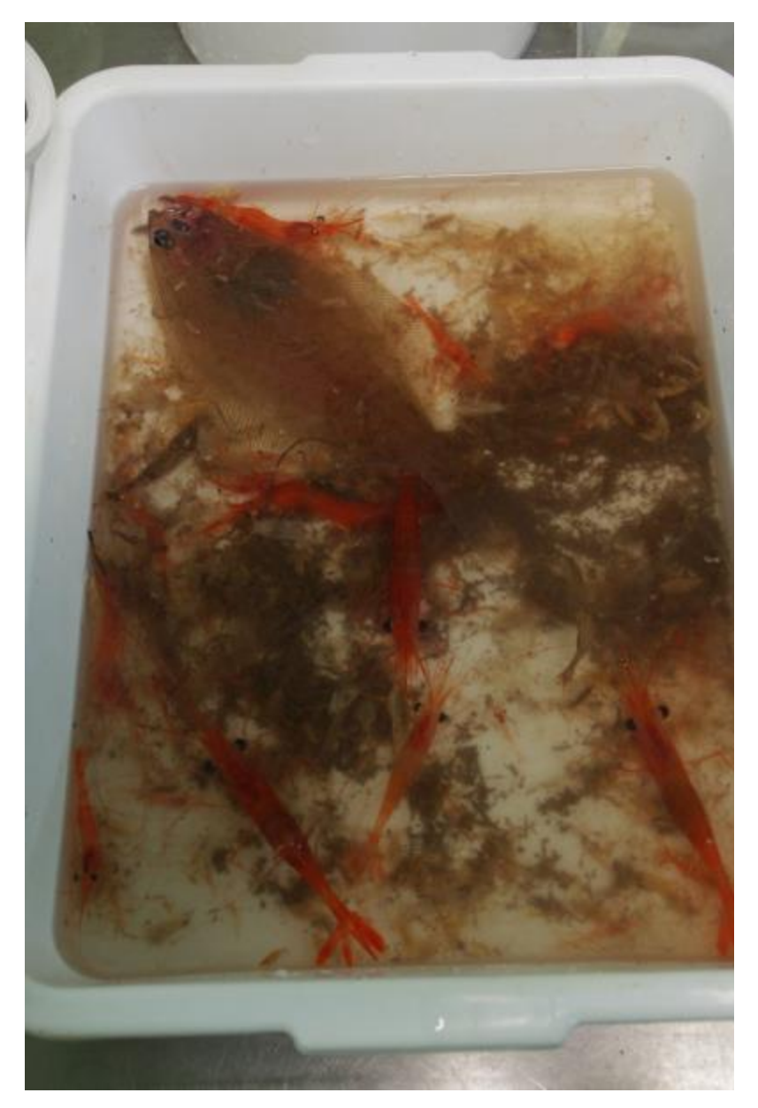
Figure 5. Epibenthic sleds catch