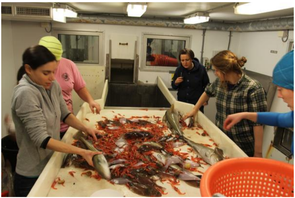
Figure 8. A catch from the benthic trawl