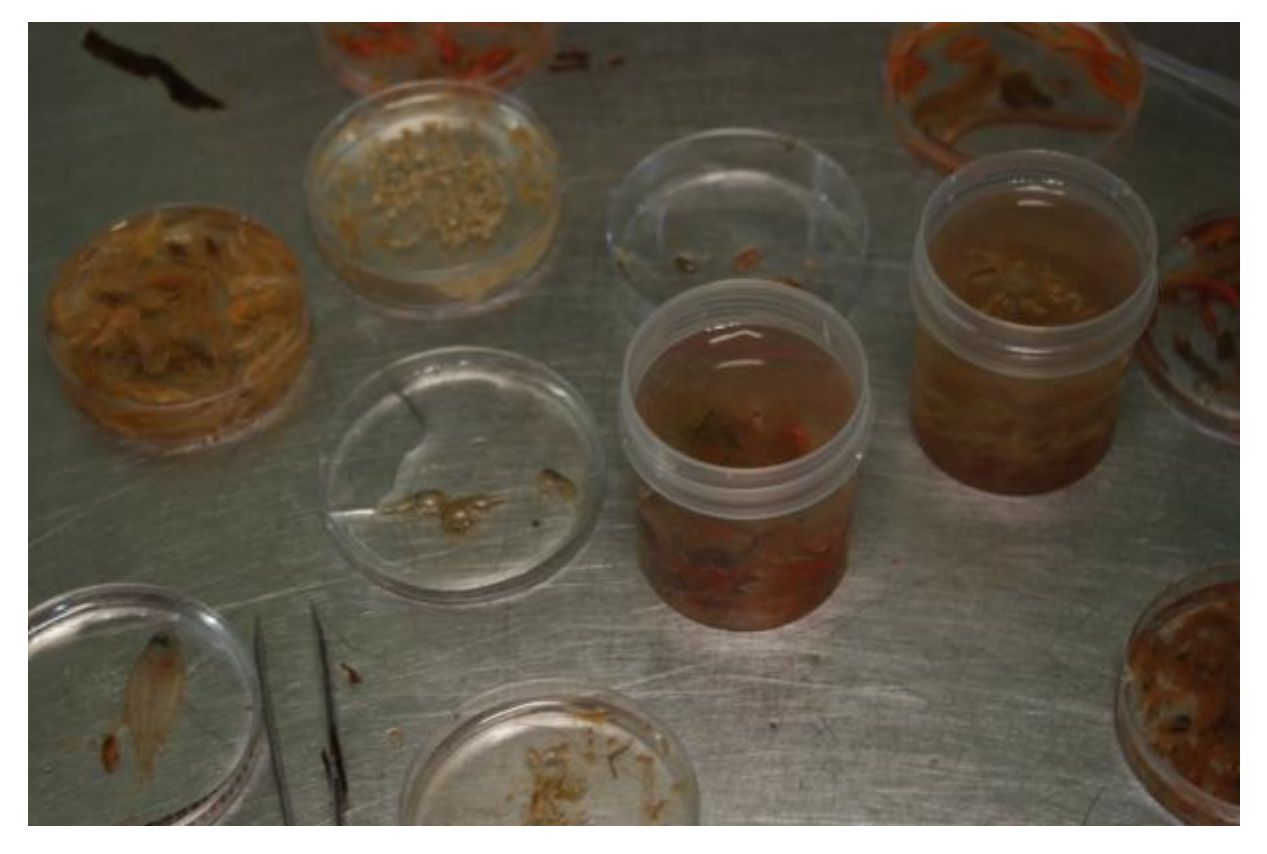
Figure 6. Sorted animals ready for the identification