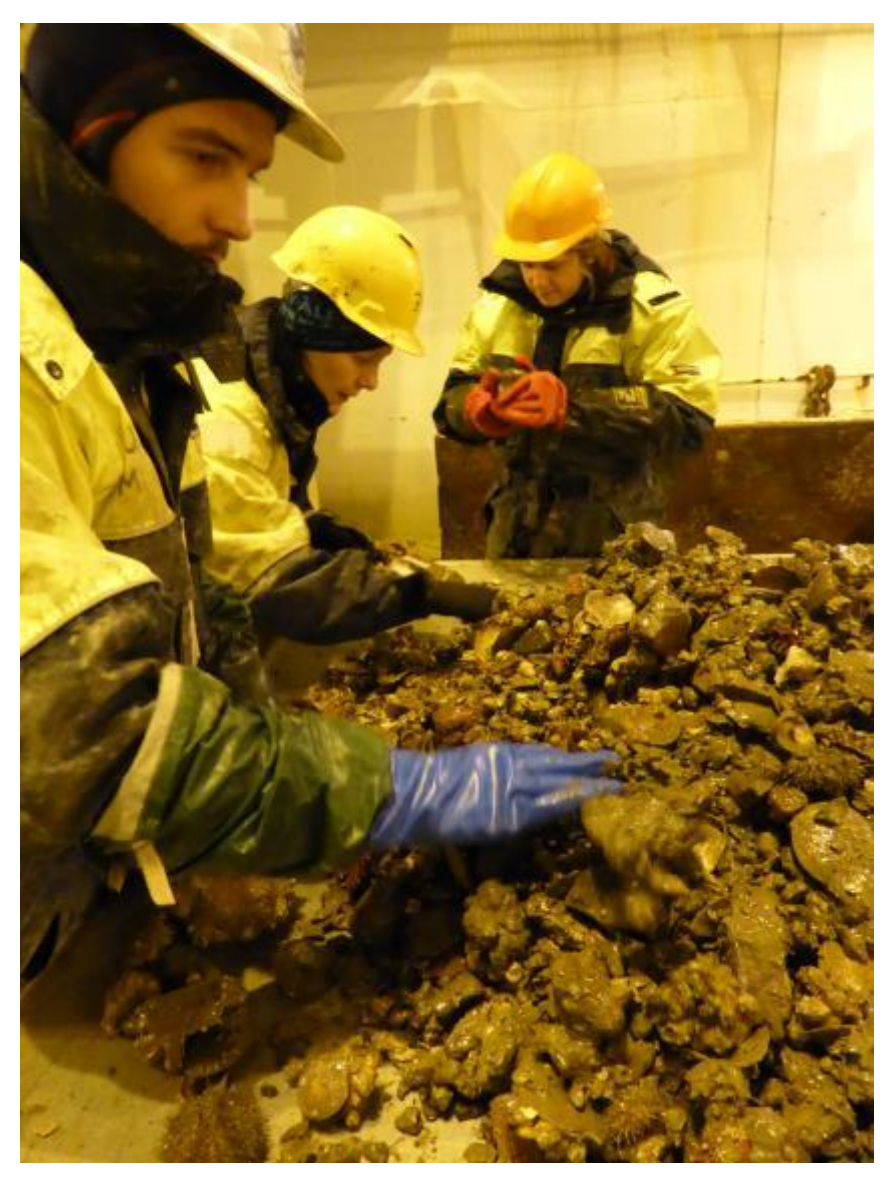
Figure 9. Searching for an appropriate rocks in the material collected with a triangle dredge