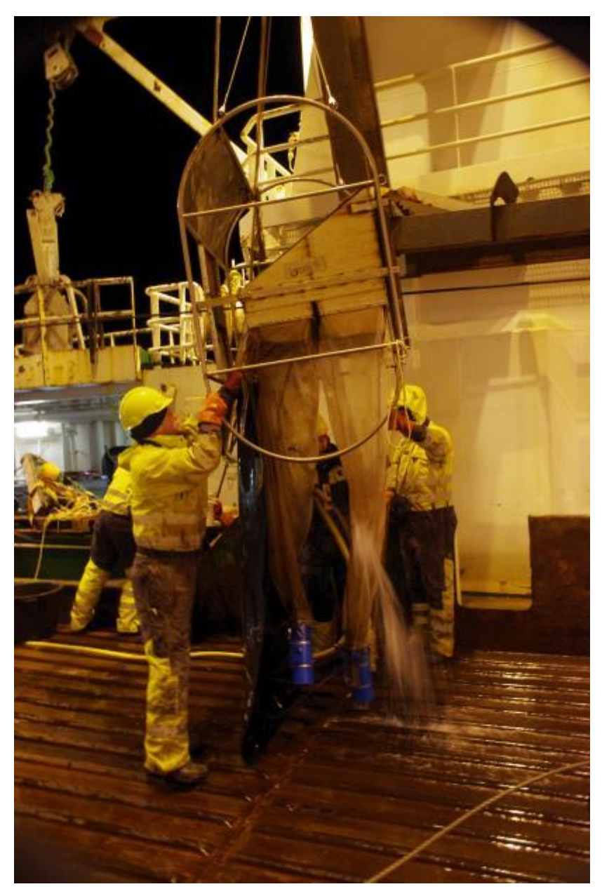
Figure 4. Epibenthic sleds pulled out from the water