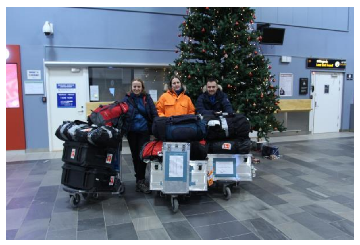
Figure 1. Finally in Tromso with all 10 pieces of our luggage