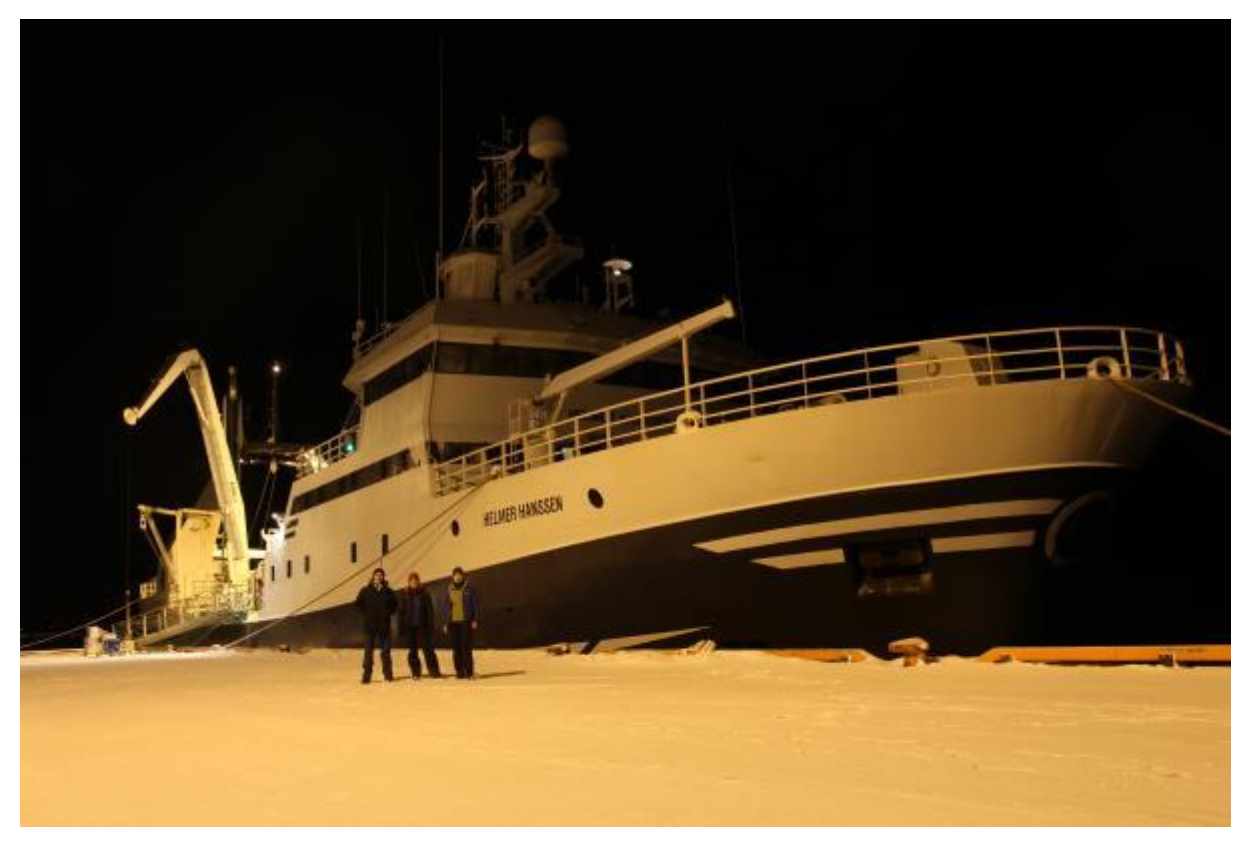
Figure 3. IO PAS benthic team ready to head north